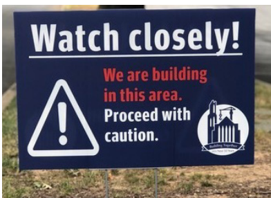
Signs for safety.

Over the last several months, NPC staff and lay teams have diligently cleared out storage areas in anticipation of the construction project. To make room for temporary storage during the project, we've rented two, large weather-proofed storage units which are placed close to Stone Hall for easy access. And MCN Build's Construction trailer is now onsite over near Agencies / Multi-Purpose parking lot.