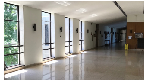
...and there was light!

In mid-June, the four Booth stained glass windows from our predecessor church, Church of the Covenant, were removed. These windows, located just outside the Parlor on the main level, were in disrepair and needed to be removed to make room for our two new elevators. A specialty firm from Minnesota, Cathedral Crafts, carefully removed and shipped them to their workshop where a year-long restoration process will take place. When they arrive back at National, we will find another location in the Church building in which to display them.