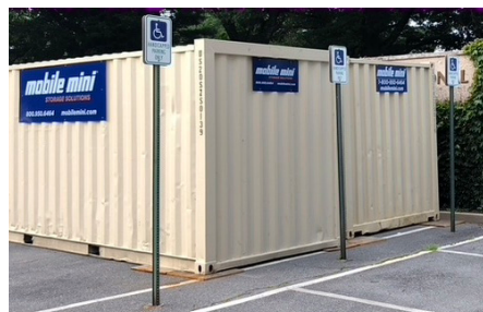
Storage units are onsite and filling.