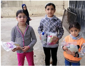
Beirut children with food and supplies

NPC's Capital Campaign Partner National Evangelical (Presbyterian) Synod of Syria and Lebanon (NESSL) has especially appreciated our financial support in what became an unprecedented year of need. The Presbyterian church in Syria and Lebanon has been operating four Syrian curriculum schools in Lebanon in the towns of Min Elias, Minyara, Tripoli, and Sour. But in 2020, Lebanon was crippled by four simultaneous challenges: