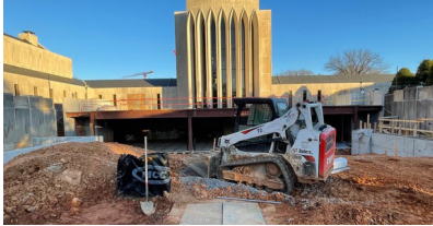
Garden Rooms progress