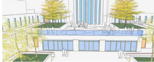
Artist's rendition of Garden Rooms