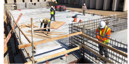
Plaza decking underway