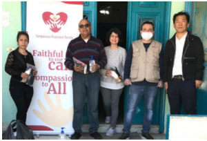
Compassion Protestant Society Staff and Volunteers