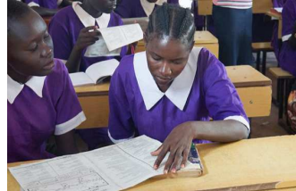
Studying at school