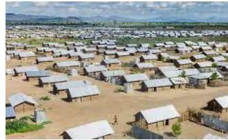
Aerial view of Kakuma Camp

The International Association for Refugees (IAFR) uses NPC's Capital Campaign grant to provide essential services to refugees residing in Kakuma and Kalobeye camps in Kenya who were forced to flee war or disaster in their native countries. Approximately 186,000 have been resettled in Kakuma and approximately 40,000 in Kalobeye, with another 3,000 internally displaced Kenyans in Turkana West.