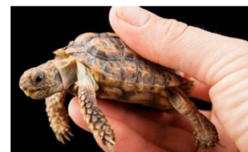
Speckled padloper tortoise- smallest tortoise