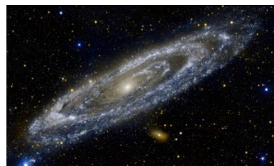
Andromeda Galaxy, Hubble

4yet their voice goes out through all the earth, and their words to the end of the world.