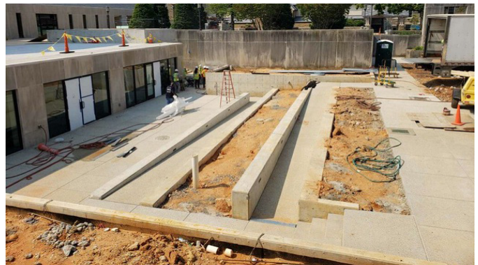
Garden terrace and ramp construction

The new outdoor UPPER PLAZA in front of the church on the Sanctuary level is nearly complete! This large, new space is available because of the new Garden Rooms constructed below. On the edge of the upper plaza is a GLASS GUARDRAIL , which means that everyone on the upper plaza can easily see our beautiful fountain. The planters that frame both sides of the upper plaza with soon have Ginko trees.