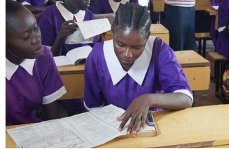
Studying at school