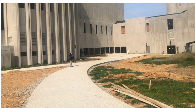
Sidewalks at new entrance

And just outside the Youth House, the youth-requested GAGA PIT is nearly complete! The gaga pit was designed and constructed by several Facilities Council members and, earlier this month, many of our youth eagerly assisted leaders in assembling it.