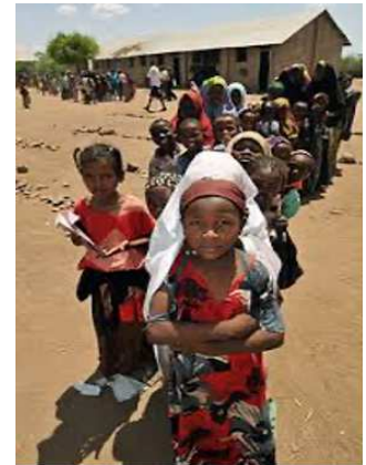
Waiting for camp services

Students in Kenya are required to pay for their own education beyond primary grades, and what education there is in the refugee camps does not lead to a high school diploma. The five girls attend boarding school in different areas of the country with the potential of receiving additional support from Lutheran World Federation to pursue advanced degrees. In spite of the additional constraints associated with Covid, the girls have made academic progress.