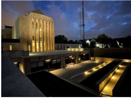
Lighting, Secure Doors & Locks