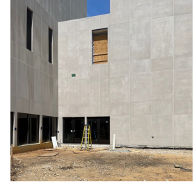
New Entrance under construction