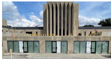
Garden rooms doors and windows

The GARDEN ROOMS are light-filled by large, glass windows while five sets of doors provide easy garden access. On the Sanctuary level, two pairs of glass doors are in place for convenient passage to the newly enlarged PLAZA above the Garden Rooms, and four pairs of doors have been installed at the NEW ENTRANCE .