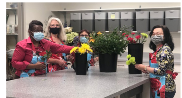
The flower team loves their new space!

The FLOWER ROOM is occupied! Now demolition is underway to upgrade the former Flower Room (next to the Parlor) to serve as the Sacristy as well as a Kitchenette to support events and activities on the Sanctuary level.