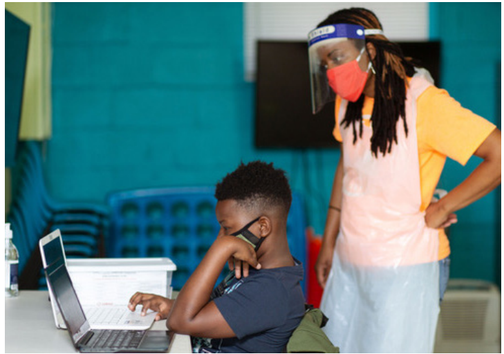
A Learning Hub student getting homework help.

Since January, Little Lights staff have been piloting a College and Career Readiness program, and they are seeing remarkable results: drastically improved grades and even one college acceptance! Some school administrators have been so impressed with the results that they have asked if additional students can participate. As more middle and high school students join, both the scope of the program and the need for resources continue to grow. Services include essay-writing skills for applications; connecting students with tutors; navigating available financial aid, scholarships and grants; offering SAT prep classes; college and vocational school guidance services; and helping students determine careers that match their individual gifts and skills.