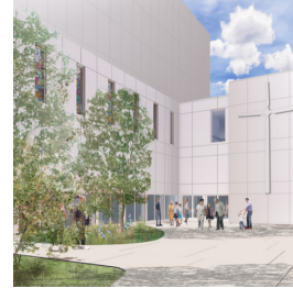
Artist's rendering of the New Entrance

As you walk into the entrance, you'll pass through a VESTIBULE with air lock doors providing shelter from inclement weather. When you enter the main LOBBY , you'll immediately see a large wall with a video screen as well as directional signage. While this area will display important information for everyone, it will be especially helpful for first-time visitors. Our two new ELEVATORS are also located in the Lobby, and it's just a few steps to the COLUMBARIUM, STONE HALL , and the new CENTRAL STAIRS , which take you to the middle level and Sanctuary levels.