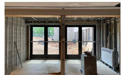
New Vestibule taking shape