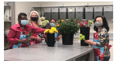
The flower team loves their new space!

The FLOWER ROOM is occupied! Now demolition is underway to upgrade the former Flower Room (next to the Parlor) to serve as the Sacristy as well as a Kitchenette to support events and activities on the Sanctuary level.