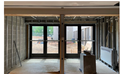
New Vestibule taking shape