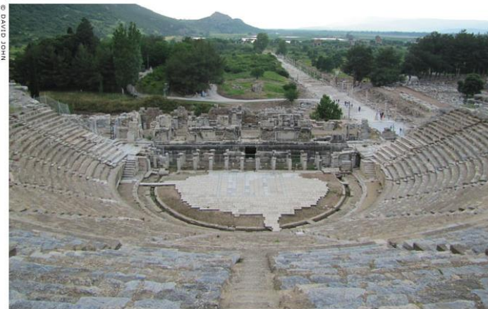
The Great Theatre of Ephesus. The view from the audience seating (cavea).